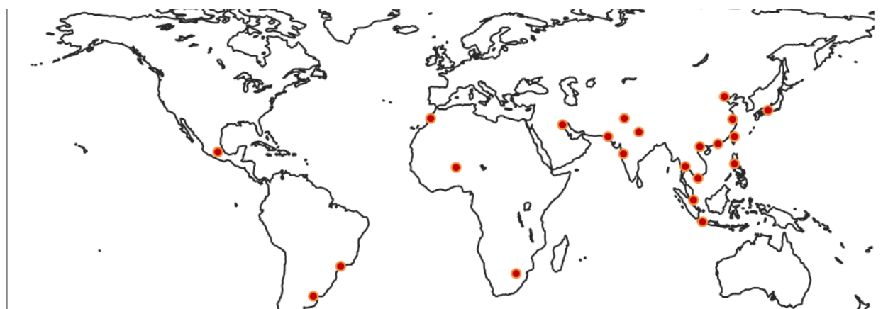
Figure 2. General priority locations of PM 2.5 monitors for initial deployment.

Figure 2 shows 20 locations that were determined from these criteria. Sites are clustered in regions with high population density and few PM 2.5 measurements. These measurement sites span a variety of regions that are not well represented by existing ground-based networks. For example, they include regions of biomass burning (e.g. West Africa, South Asia), biofuel use (e.g. South Asia), monsoonal cloud patterns (e.g. West Africa, South Asia), and mineral dust influence (e.g. North Africa, Middle East, East Asia). Sites also span a wide range of PM 2.5 concentrations from highly polluted (e.g. Beijing) to relatively clean (Kenya).